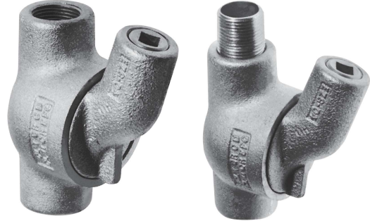
Male & female hub