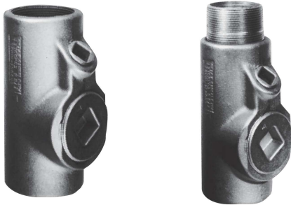
Vertical or horizontal male & female